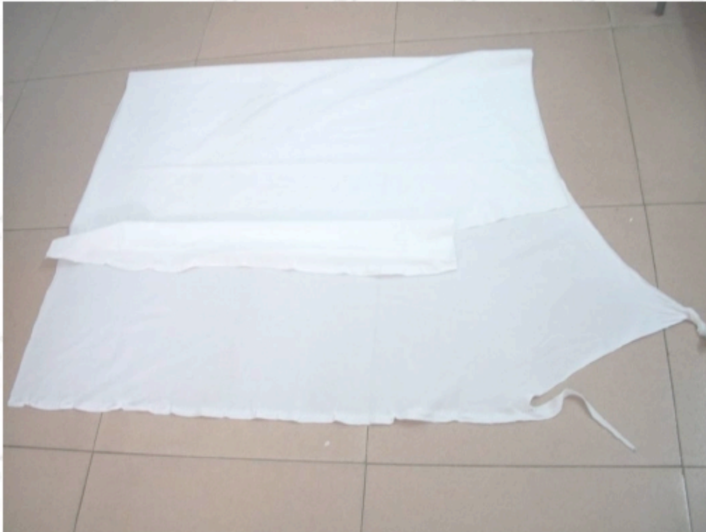
Overall View of Sample